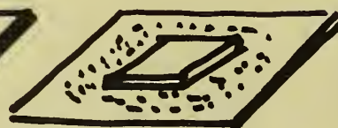
dip in flour